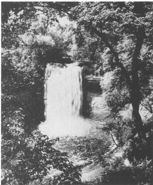
ENCHANTING MINNEHAHA FALLS —Immortalized by Longfellow in the poem entitled "Song of Hiawatha," these falls are located in the park of the same name. Minneapolis, the site of the 1954 fall meeting, has 142 other parks.